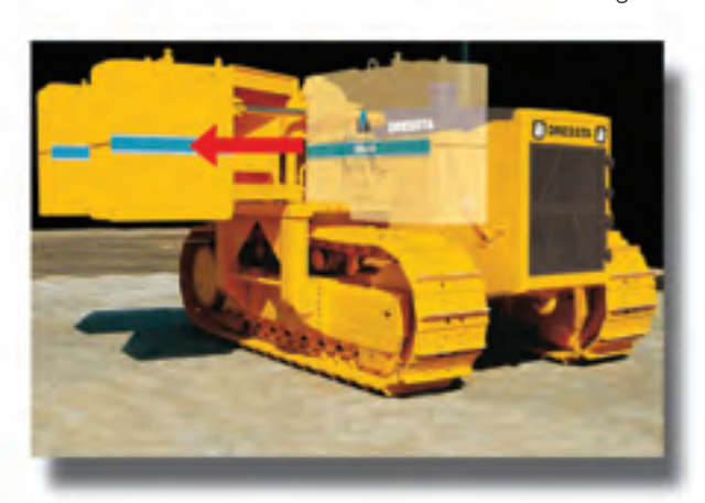
Boom, hook and counterweights controls

Extendable and retractable counterweights