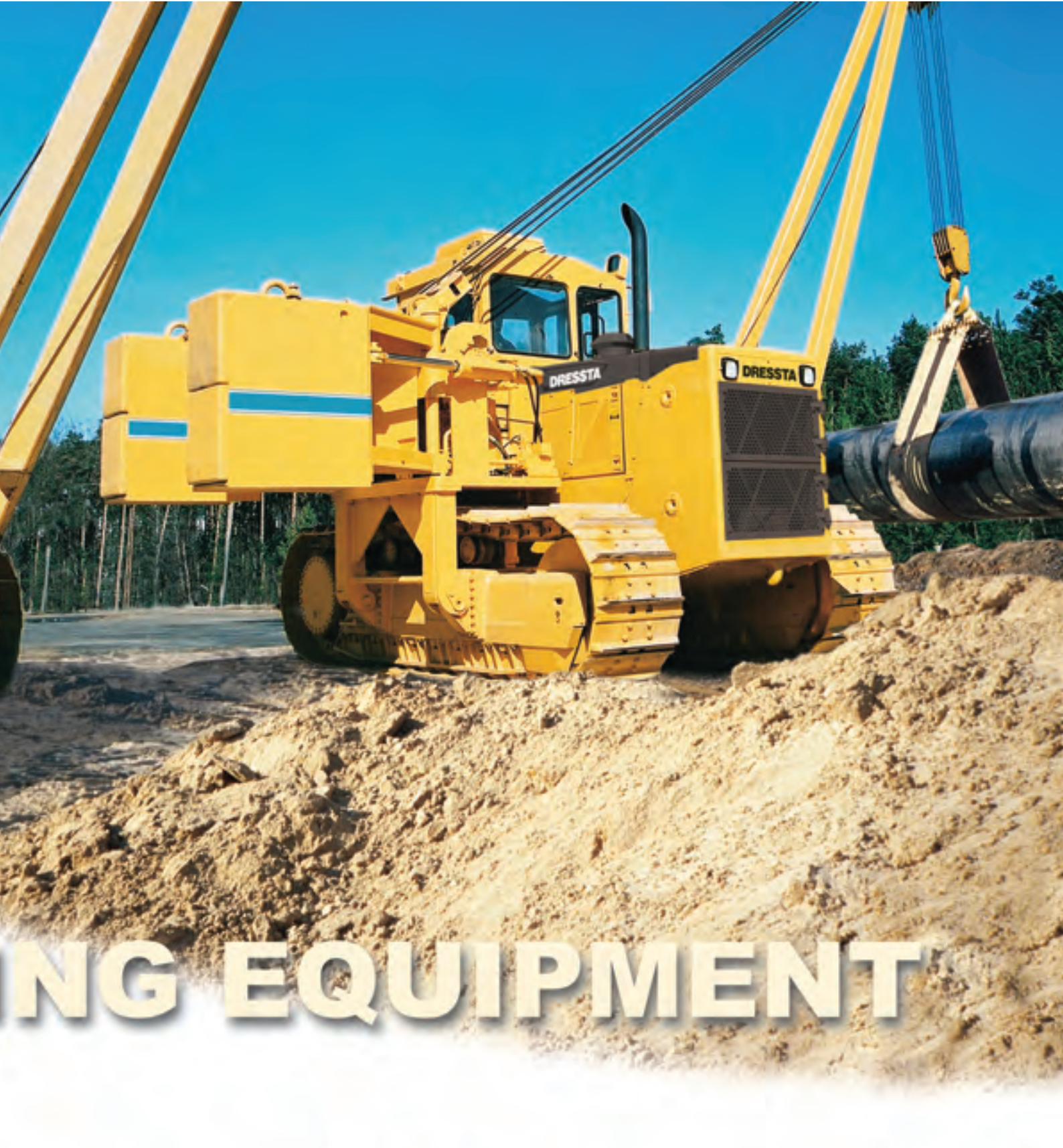
Automatic boom kickout