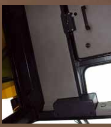
Cab roof window provides all operations while the em provides operator's