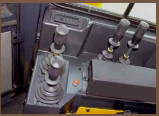
The two front levers control winches of the pipelaying equipment while the side levers actuate the counterweights that maintain the proper stability of the machine.